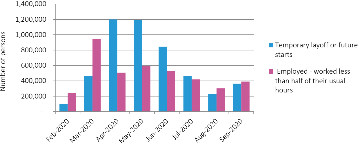
Figure 3: Supplementary Labour Force Indicators, Canada

Figure 3 shows information from two indicators developed by Statistics Canada to capture the impact of COVID-19 on the Canadian labour market. In September, the number of laid-off workers went up by 362,900 following a decline over the previous three months. Similarly, the number of employed persons who worked less than half of their usual hours increased for the first time in three months.